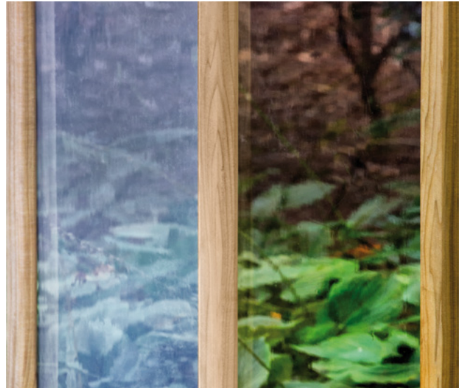
ETFE (left) and Halar® High Clarity ECTFE (right) films, 250 microns (10 mils)

Targeted applications include canopies, facades, domes, and umbrellas for residential and public facilities such as stadiums, airports, train stations, commercial centers, and swimming pools.